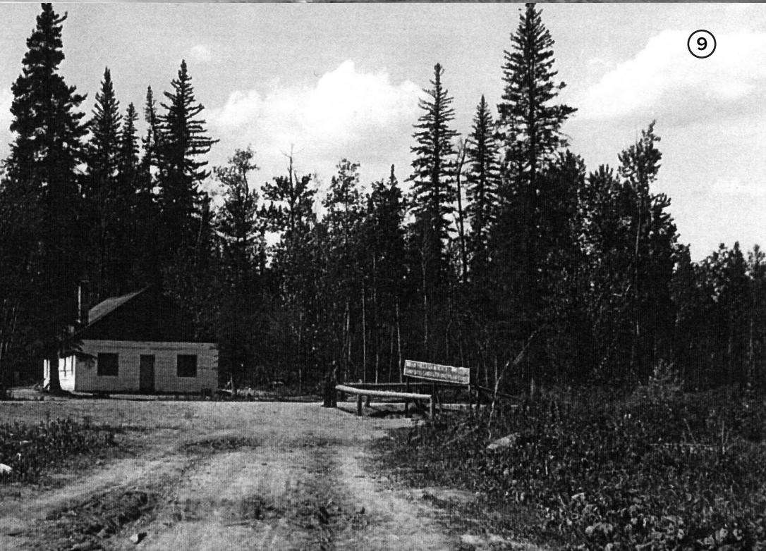
Teacherage, Montreal Lake.